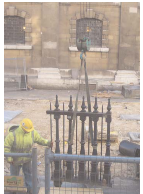
Removal of the iron railings from around the site ready to be sent to Bristol for restoration

traffic, the railings will enclose a calm courtyard where people can escape some of the bustle of London and enjoy the artistry of a re-designed new East Window of St Martin's, gleaming above.