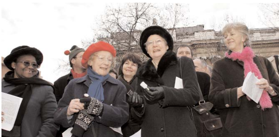
Guests poised with party poppers, ready to commemorate the beginning of the Renewal of St Martin-in-the-Fields with a bang!

"...Literally hundreds of people have been involved in preparing for this moment. It has been a remarkable work of human endeavour. It is right to gather to ask God's blessing as the physical work really begins."