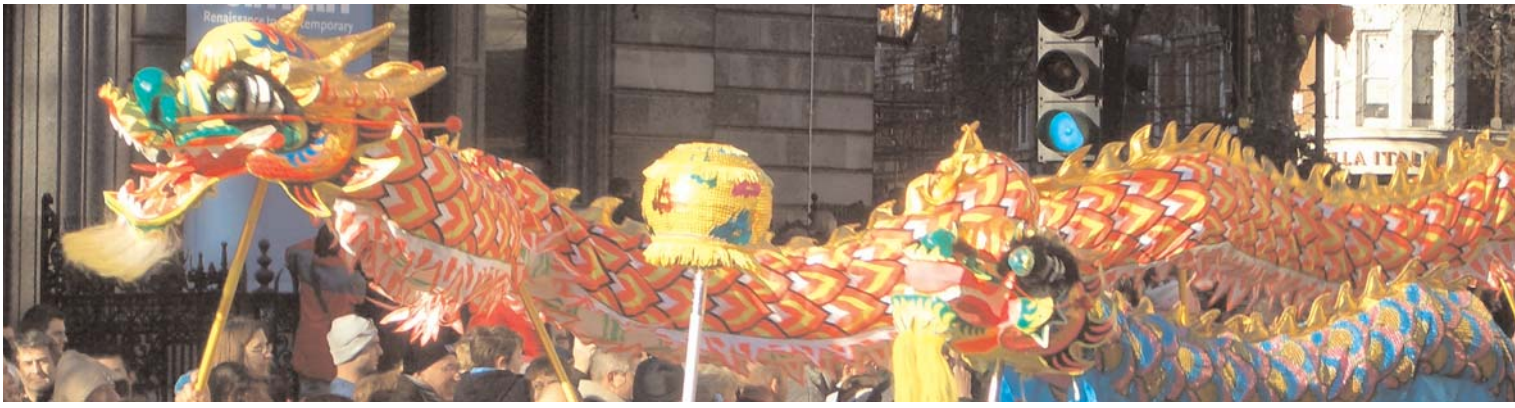
Traditional festivities take place on Charing Cross Road to mark Chinese New Year