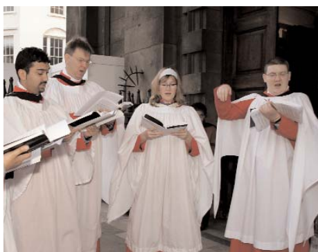
The Choir of St Martin-in-the-Fields sings on the portico