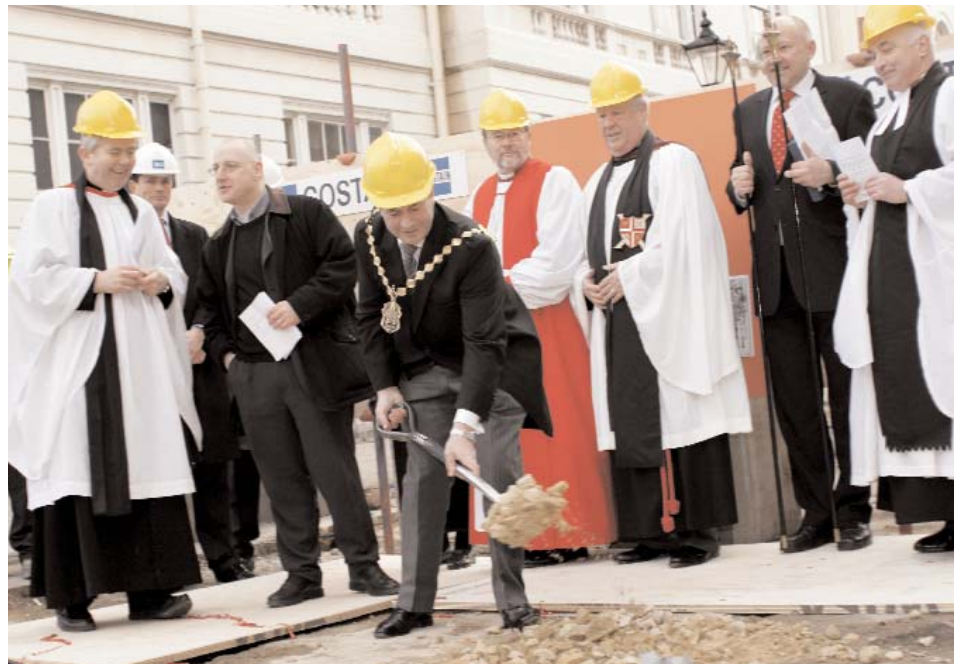
The Rt Worshipful the Lord Mayor of Westminster joins the St Martin's team in turning a shovel of earth