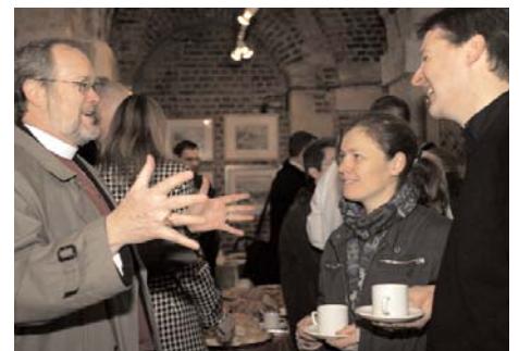
Guests enjoy a celebratory reception in the Gallery under the church