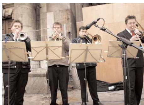
The brass quartet from the Guildhall School of Music and Drama