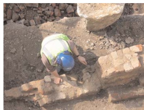
Images: (top) Alison works near a well found on the site of a 16th century building, (centre) one of the medieval burials discovered to the north of the church, (bottom) one of MoLAS' archaeologists uncovers a wall from a building demolished to build the North Range