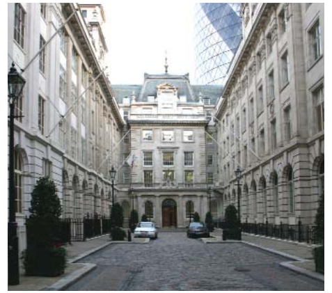
Leathersellers' Hall in the City

“Today the Leathersellers' Company continues to take an active role as an advocate for the leather trade, and provides a social forum for its members. Its main work, however, is charitable and educational. Close links with two schools (Colfe's and Prendergast, both in SE London) and the British School of