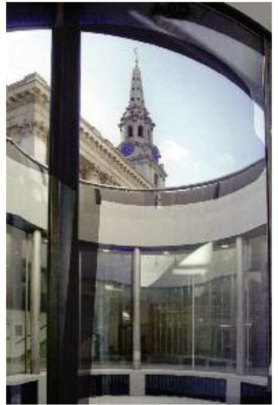
(Left:) The Café in the Crypt has expanded St Martin's hospitality (Right:) The new light-well brings daylight flooding into the new underground areas, and offers a stunning view of the church from below