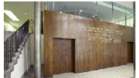
St Martin's Hall