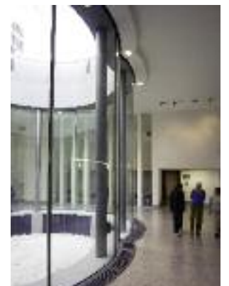
The meeting rooms inside and outside, The Sir Neville Marriner Music Rehearsal Room and the light-well